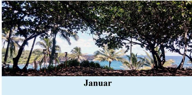
(a) Top view