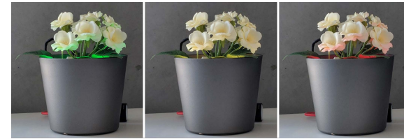
(a) persistent display: on the plant pot

For the demonstration of our smart plant systems in an environment with no access to water or draining possibility, such as a meeting room or a fair, we decided to use a variety of the magnetic field to simulate the watering of a plant. Therefore, we integrated a magnet into a watering can and replaced the moisture sensor with a hall sensor and integrated a magnet into a watering pot.