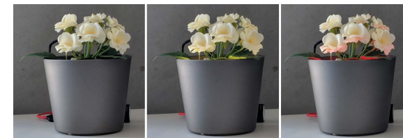
(b) event-based display: on the plant pot